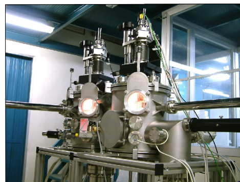
fig. 2 Liquid sample RF Magnetron