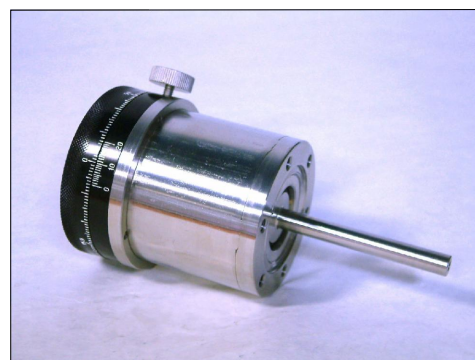
fig 3 CF40 Magnetic Rotator